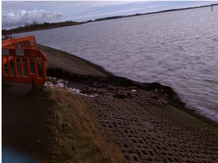
Plate 1: Structure failure.

The contract was awarded to APA Concrete Repairs Ltd